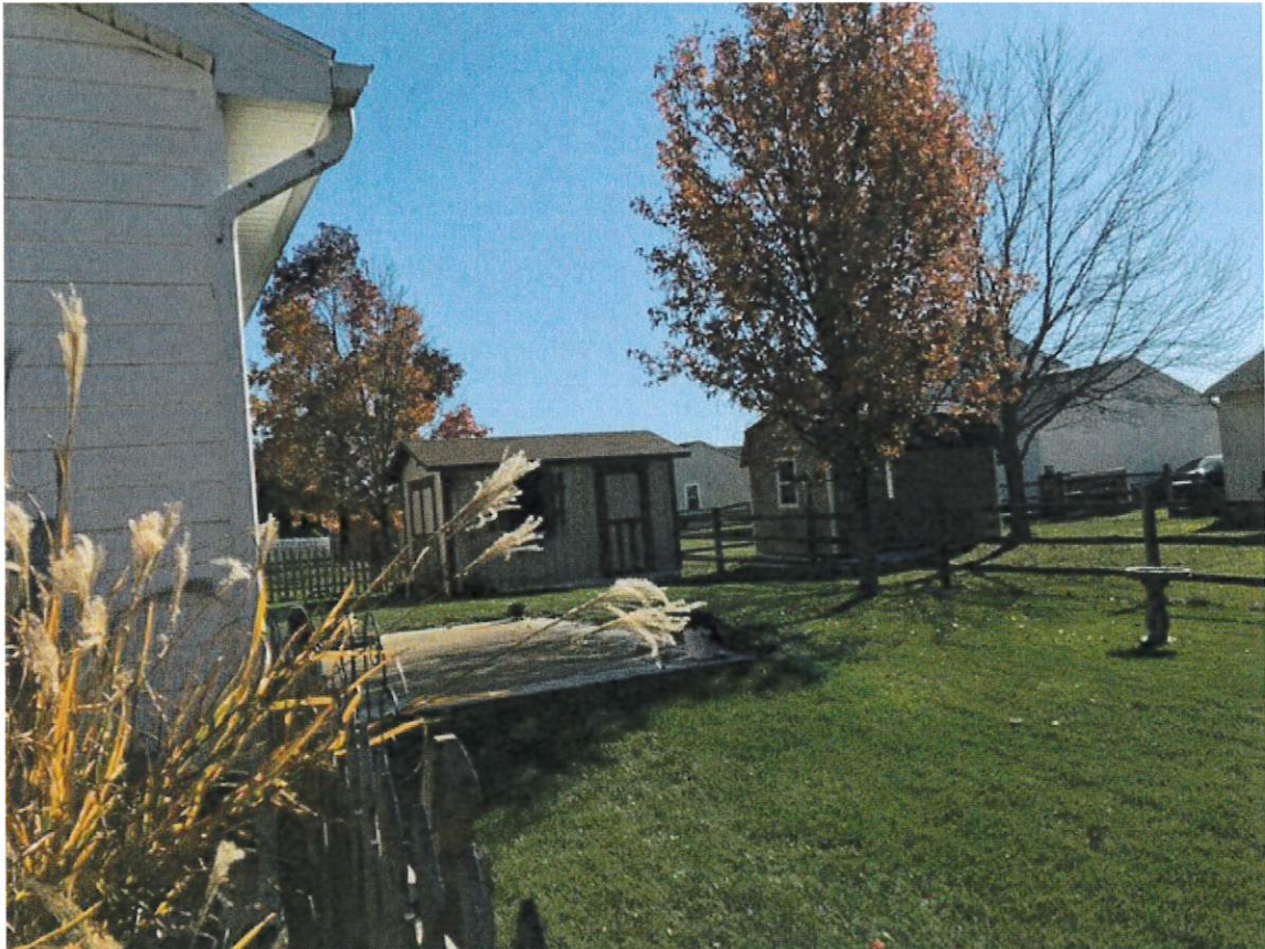
Backyard photo of 425 Crossbow Drive, Mainville, OH 45039: